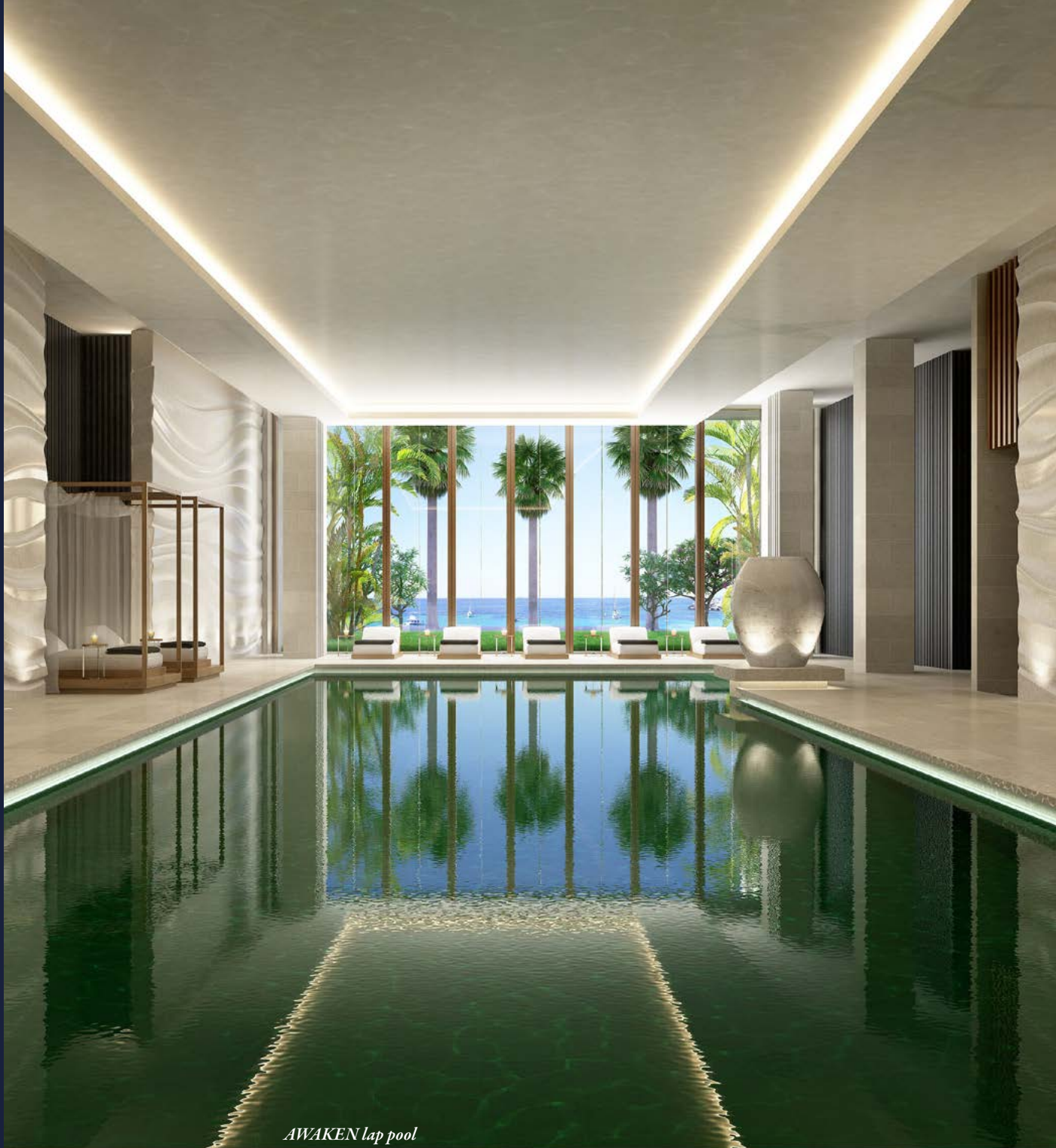
AWAKEN lap pool

Harnessing state of the art technologies, a personal journey is created for each guest incorporating all the elements; fire for the mind, nature for the body, water for emotions and air for the spirit. Some of these elements even make it into the 17 treatment rooms in the form of fireplaces and floor-to-ceiling fish tanks. There's also a snow sauna to improve circulation, Halotherapy Salt Caves for allergies, a traditional six room Hammam Sensorium, and a Chromotherapy Lounge where the light spectrum is used to heal.